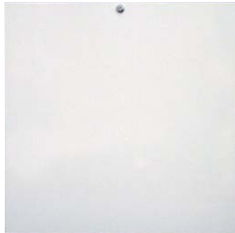
Avanti LC Steel ES