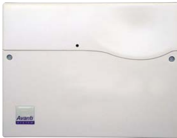
Avanti LC Polycarbonate ES

Avanti LC can be programmed for Fire, PA, Chime and you can even connect a bell push to the system as Avanti LC also provides you with a Front Doorbell option.