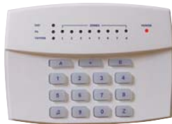
Avanti LED RKP