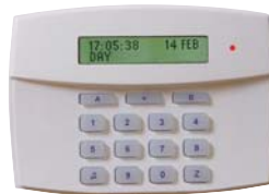
Avanti LCD RKP